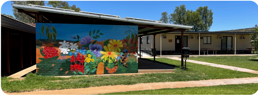
Our new mural next to the Girls Academy.