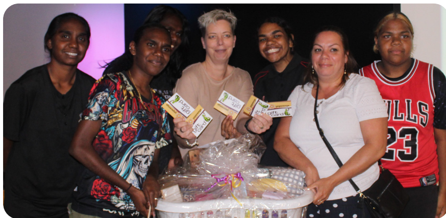
Major winners from the Girls Academy quiz night.

The senior ladies also continued with fundraising for their end of year trip by holding a Trivia Night at the school. The ladies sold raffle tickets, drinks and food. It was a late night for them, but they had fun and enjoyed seeing staff and their families outside of school hours. A big thank you to the senior ladies who helped out on the day and night!