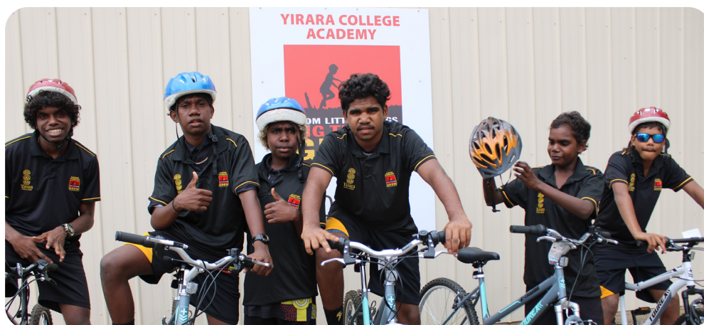
Middle school fellas testing out some bikes donated by Clontarf partner Kmart.