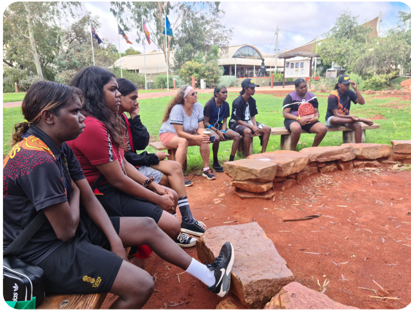
Senior Ladies on their trip to Uluru.