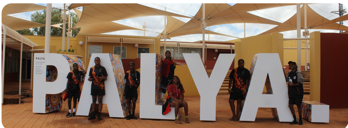
Senior Ladies enjoying their trip to Uluru.

The highlights of the trip were the scenic views of Uluru-Kata Tjuta during the rains, camel riding, tours of expensive hotel accommodations and fine dining every night.