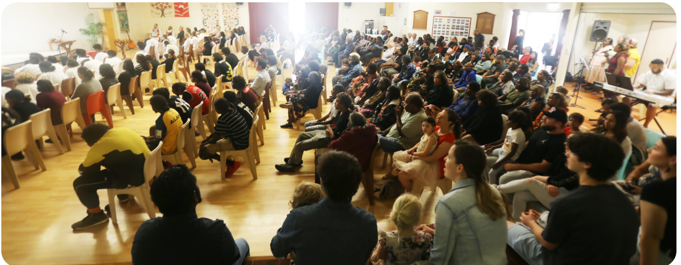
First communion and baptism service.

May God bless you and keep you safe this Christmas as we look forward to 2022.