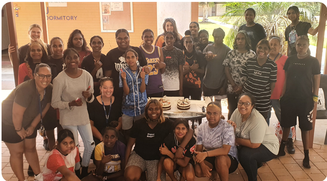
Female Boarding ladies celebrating a birthday.

This year, Term four finished a few weeks early with students travelling back to communities due to COVID-19. We have missed having the ladies in our dorms, but staff are glad that everyone arrived home safely and have been enjoying some valuable, and extended time with their families.