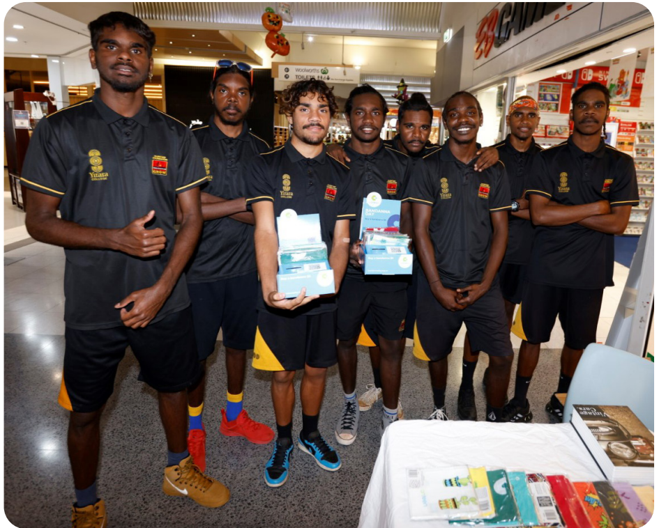
Senior Fellas selling bandannas for Teen Cancer.

Our junior crew spent quality time at Ormiston Gorge where they were wowed by the volumes of water and the lush green hues that the rain had brought. Year 10 and 11 fellas had a day off campus making the most of what Alice has to offer and forming a strong support network ahead of stepping into peer leadership roles at Yirara in 2022.