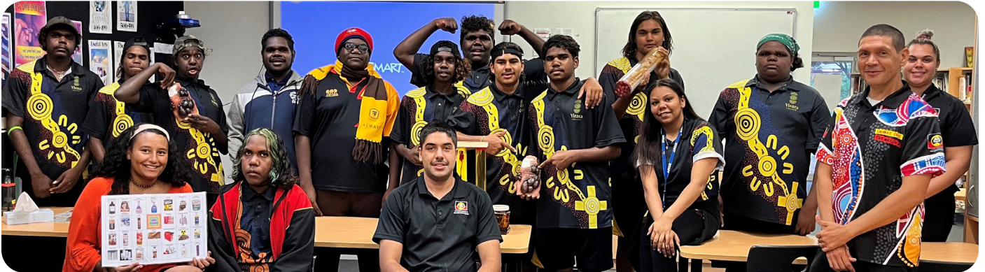
Staff from Congress talking about healthy living with our Year 9 students.

This term the Year 9 classes of Yirara College had the opportunity to attend many off campus excursions and host several guest speakers from the local community. Some of the key excursions involved visiting the Desert Park, Lutheran Community Care Hub and the Hartley Street School. These excursions provided students with the chance to develop their confidence and conduct themselves as representatives of Yirara College when out in the community. Students were also able to learn and reflect on the type of workplace skills and behaviours needed as a working member of a community.