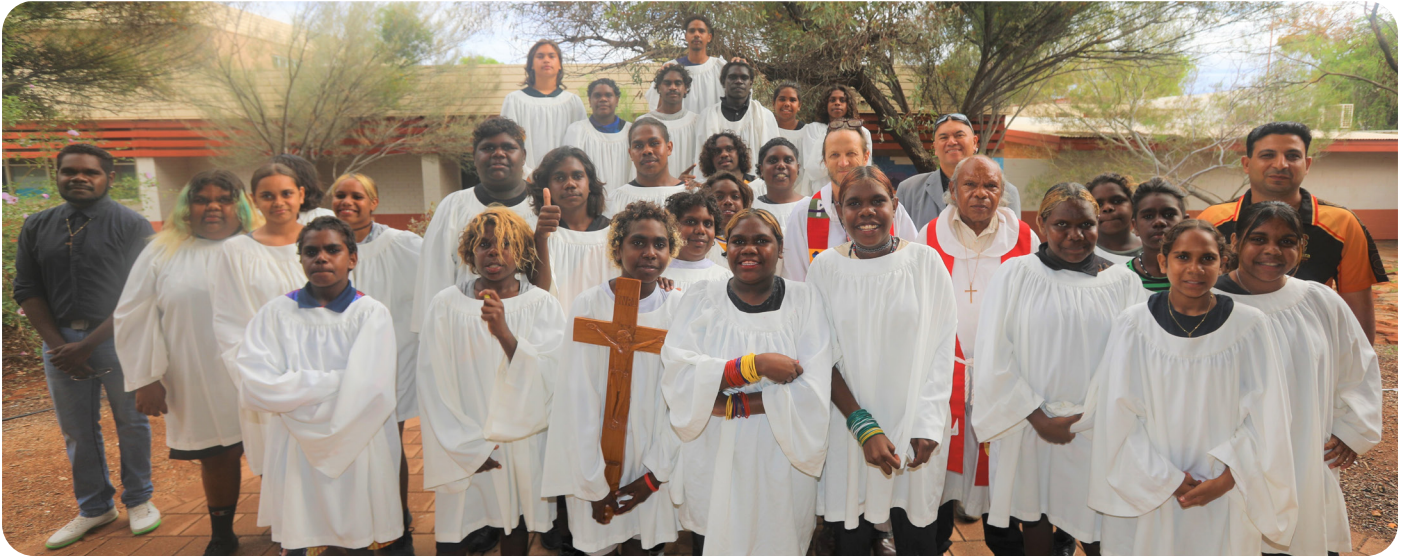
Yirara students who took part in their first communion service.

Yirara College Baptism and Communion Day was celebrated this year on Sunday 7th of November. Families of students involved travelled a long way to be there.