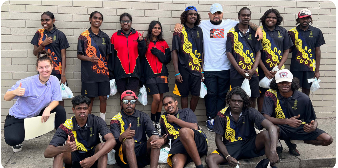
The Coles' Work Experience team.

Congratulations to all our senior students for engaging in Yirara Pathways programs. Despite the challenges faced this year with the many changes due to COVID regulations and mandates, students have persisted and worked hard at completing their VET training units. All seniors have participated in work experience, learning new skills on the job.