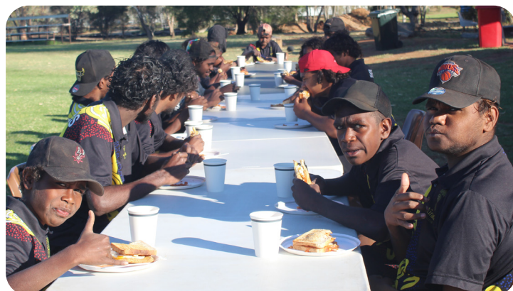
The Fellas enjoy a sit down breakfast at Wednesday morning training