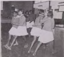
These girls are doing their folk-dancing