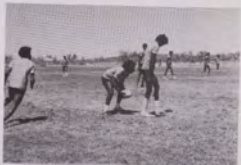
On the Football field.