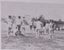
The staff at half time.

The second half was very even with both teams defending desperately. No tries were scored in this half and so the final result was a draw (one try each).