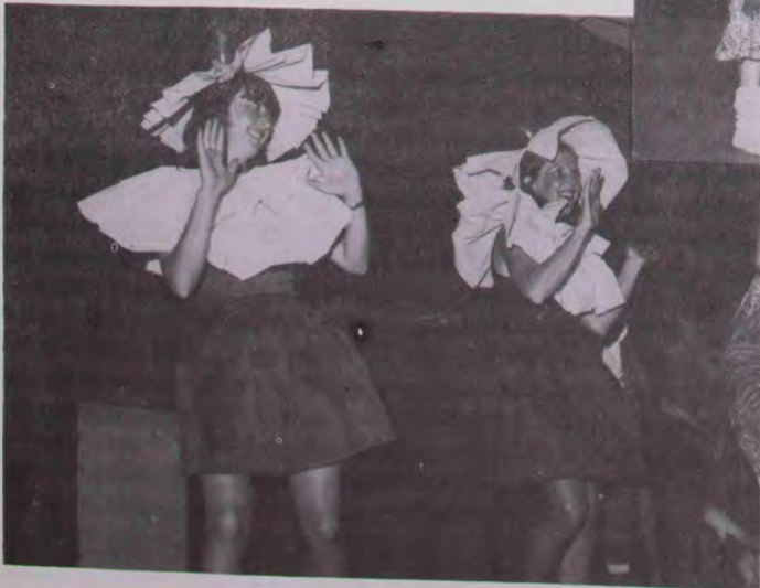
Scenes from the concert.