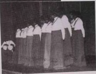
Singing at a concert.