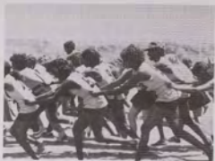
At the athletics.