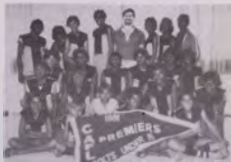
● 1991 Under 15 Premiers