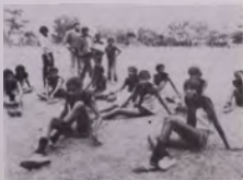
● Half time in the Grand Final