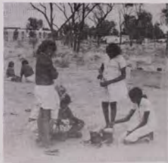
Outdoor Cooking Class