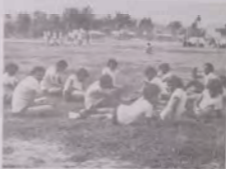
The student team