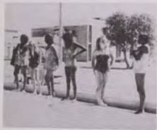
At the pool.