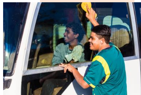
Helping to look after our buses and earning some pocket money at the same time.