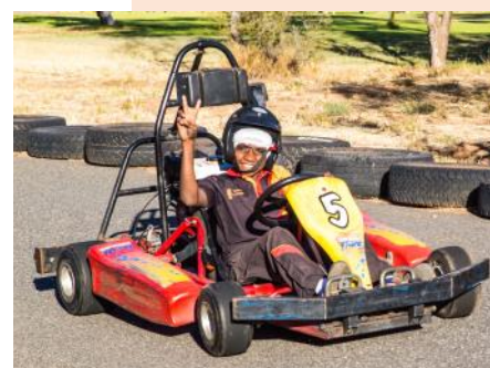
Having Fun Go-Karting