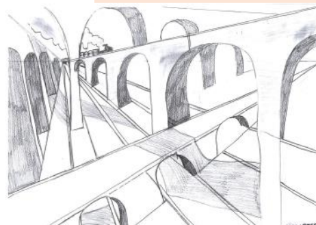
Students learning to draw with perspectives