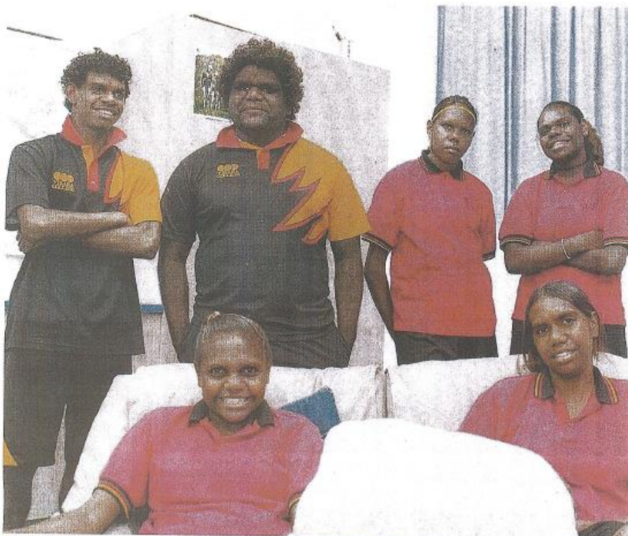
Classmates from the first ever group of Year 12 students at Alice Springs school Yirara College.